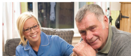
Source: American Association for Long-Term Care Insurance, 2012 LTCI Sourcebook